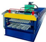
MILD STEEL DOUBLE PROFILE ROLL FORMING MACHINE

Automatic Roofing Sheet Crimping Machine, Hydraulic Single Profile Pop Machine, Industrial C Purlin Roll Forming Machine, Mild Steel Automatic Hydraulic Decoiler Machine, Mild Steel Double Profile Roll Forming Machine, Mild Steel Interlocking Tile Press Machine, Mild Steel POP Channel Roll Forming Machine, Mild Steel Sheet Cutting Machine, Semi-Automatic Metal Sheet Bending Machine, Semi-Automatic Rolling Shutter Patti Machine, Three Phase Roofing Sheet Making Machine, W Beam Roll Forming Machine, etc.