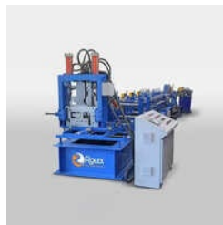
INDUSTRIAL C PURLIN ROLL FORMING MACHINE