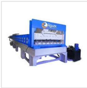
Three Phase Roofing Sheet Making Machine