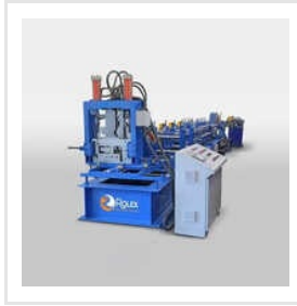
Industrial C Purlin Roll Forming Machine