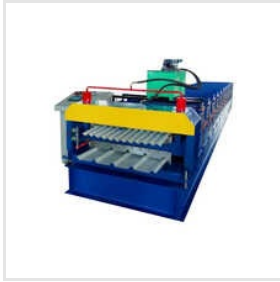
Mild Steel Double Profile Roll Forming