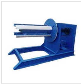
Mild Steel Automatic Hydraulic Decoiler