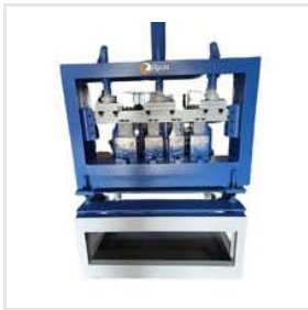
Mild Steel POP Channel Roll Forming Machine