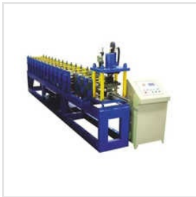
Semi-Automatic Rolling Shutter Patti