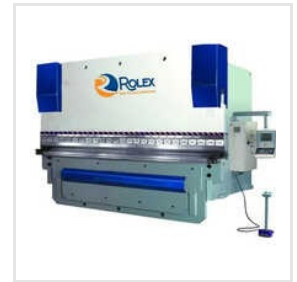
Semi-Automatic Metal Sheet Bending