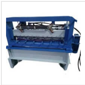
Mild Steel Sheet Cutting Machine