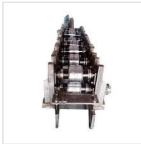
Hydraulic Single Profile Pop Machine