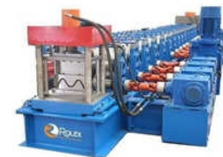
W BEAM ROLL FORMING MACHINE