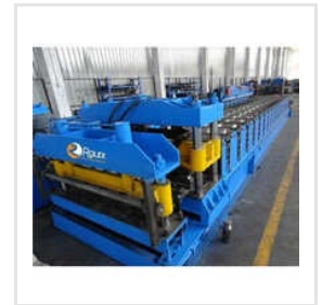
Mild Steel Interlocking Tile Press Machine