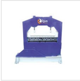
Automatic Roofing Sheet Crimping