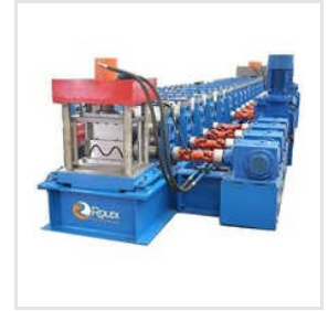
W Beam Roll Forming Machine